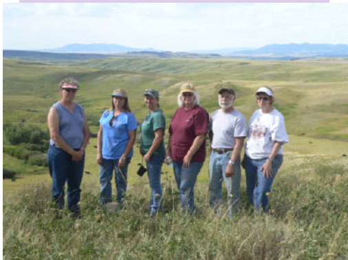
2009 Campers in our High Pasture

The ranch is 14 miles south east of Lewistown on Highway 238. East Fork dam is 3 miles away from our house and has camper spots with picnic tables. There are no electrical or sewer hookups. It is a pretty location if you want to camp by the water.